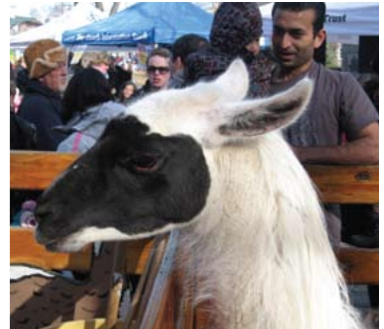
Snaps from last year's Family Day Festival