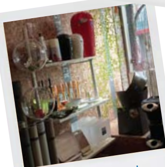
Coolness at Stack