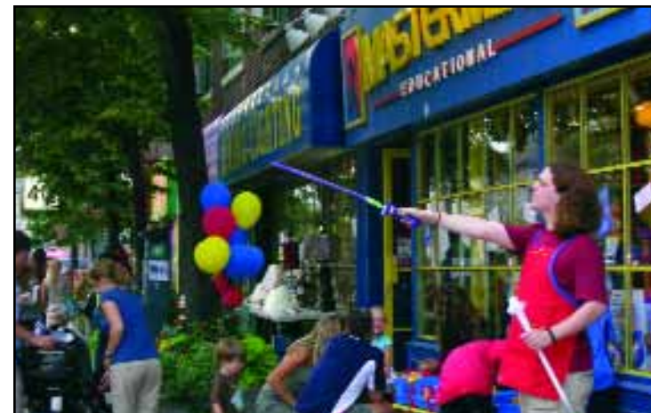
Last year, stores galore, including Mastermind enchanted big and little people so don't forget to Celebrate the Beach this year. It's returning bigger and better than ever. From cupcake decorating to snake charming and even charming Beach Guild artists here, there and everywhere (pictured on page 1 at the top of this newsletter and featured in item D on page 3).

The plan proposes using a shade of cerulean blue as our official colour, linking in a thematic way, Queen Street to the beachfront. Elements of blue will spread along the street, covering utility boxes, benches, planters, trash receptacles, and more. This will help to reduce the amount of visual clutter caused by unchangeable elements such as masses of hydro lines and utilities.