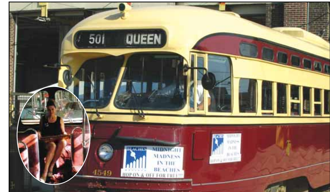
The Vintage TTC car returns for "Celebrate the Beach" on Sept. 29, complete with Winnie, Lady of the Dulcimer (inset) and lots of excitement on Queen Street East. See inside for details!! CELEBRATE!!!