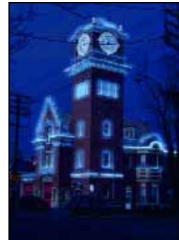
Blue LED lighting is proposed around iconic buildings such as the Firehall

The plan, which will breathe new life into our area, will be broken down into phases. We will begin working on the implementation of some initiatives as early as this fall and hope to see significant changes over the next two years. We expect the overall plan will cover five years.