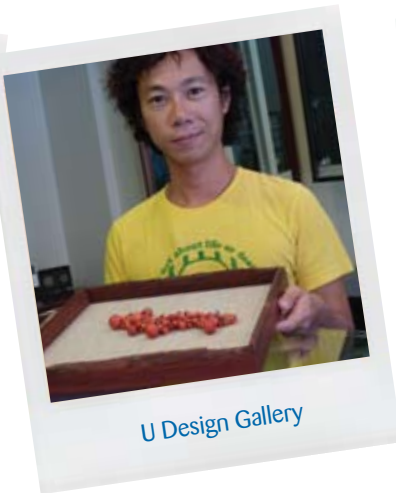
U Design Gallery