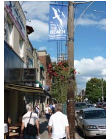
A gateway banner with a hanging basket

Additionally, we have one new bench, with more promised by the City this year and in coming years and a new posting board for community notices near Queen E. and Kippendavie Ave.