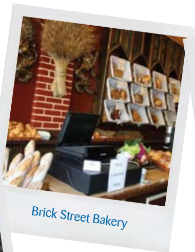
Brick Street Bakery