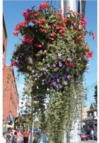
(left) Street sign unveiling (right) One of the 55 hanging baskets